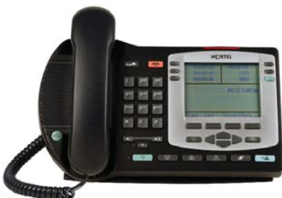
Nortel IP Phone 2004